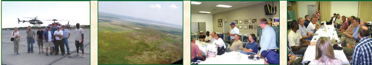
Photos from EPA Tour