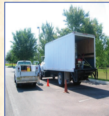
Scenes from DACS Emergency Assistance